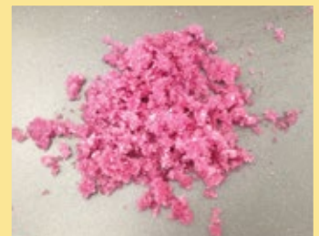
Spilled liquid has been neutralized & absorbed