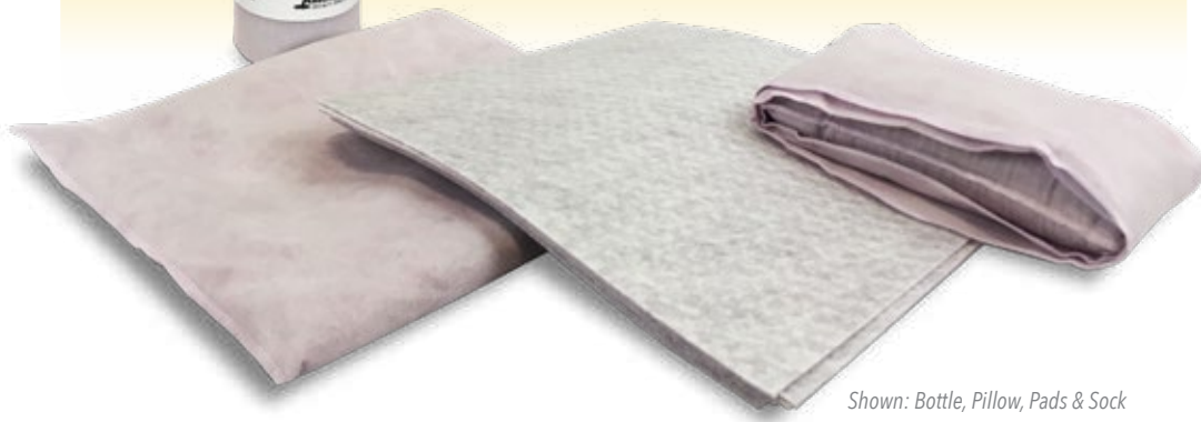
Shown: Bottle, Pillow, Pads & Sock