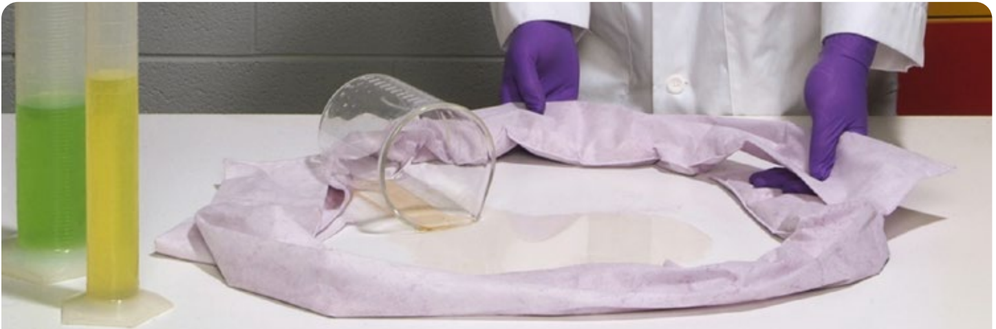
Acid Neutralizing Sock in use