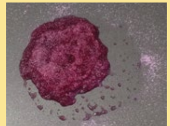
Purple color indicates non-acidic